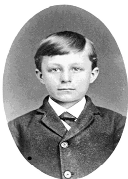
Wilbur wright (April 16, 1867-May 30, 1912)

A person who flies aeroplane is called a pilot. A man or a woman can be a pilot provided they are qualified, mentally and physically fit. There are many woman pilots also in our country. You too may become a pilot when you are grown up.