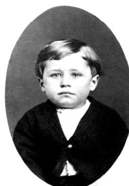
Orville wright (August 19, 1871-January 30, 1948)

The inventors of aeroplane were Orville and Wilbur Wright. On December 17, 1903, the Wright brothers made the first successful experiment in which a machine (aka airplane) carrying a man rose by its own power, flew naturally and at even speed, and descended without damage.